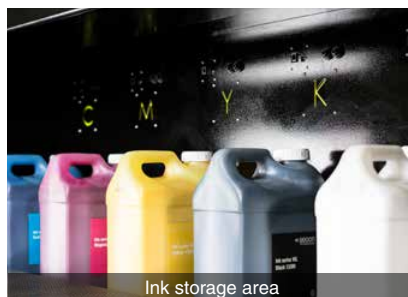
Ink storage area