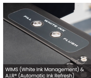
WIMS (White Ink Management) & A.I.R.® (Automatic Ink Refresh)