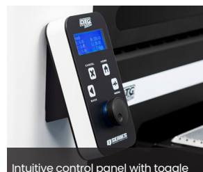
Intuitive control panel with toggle