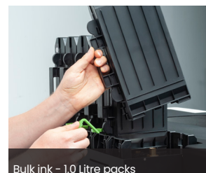
Bulk ink - 1.0 Litre packs